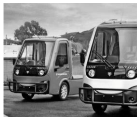
Light Utility Vehicles